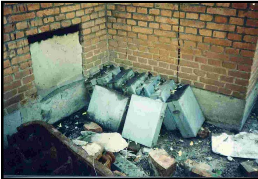
PCBs capacitors found in the 1990s at the Ziyang plant; photo by Guo Ruzhong