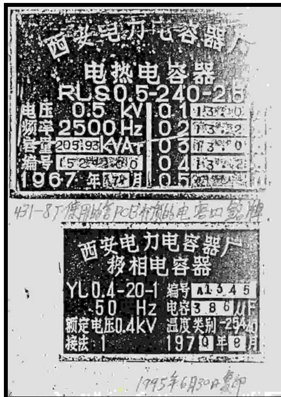
The brands of the PCB-containing capacitors