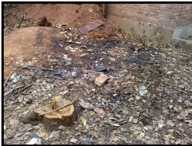
Capacitor waste removed, but PCBs oil contaminated the soil; photo taken in March 2014 by GuoRuzhong

toxicity equivalents of dioxin-like congeners varied from 75 – 24,027 pg/g – levels that are much higher than those in soils of notoriously contaminated ewaste recycling sites.