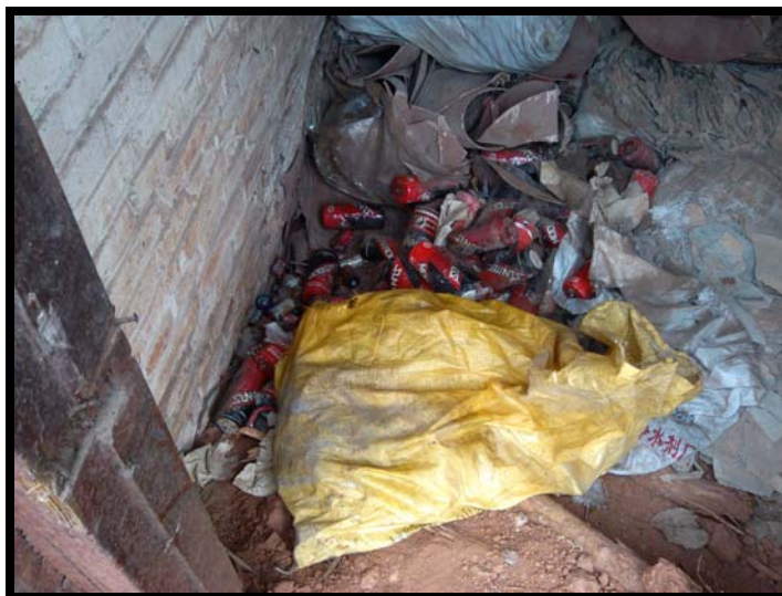
Industrial batteries found at the same hotspot site; photo taken in March 2014

In March 2014, Guo Ruzhong discovered 47 insulating paper coils sitting in a waste pile at the factory that he recognized formed part of the electrical capacitors containing PCBs. Other industrial waste was also found at the site. Green Beagle personnel requested photos and samples for testing and tests were commissioned at the SGS-CTSC laboratory in Shanghai. The results showed PCB levels as high as 8.11 mg/L – 4000 times higher than permitted under Chinese law. 15 Laboratory personnel noted that this sample had the highest PCB concentration they had ever measured. Project personnel released the data publically and called for government actions.