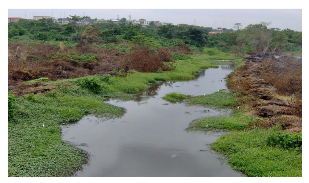
Plate 4: Part of the Lagos lagoon