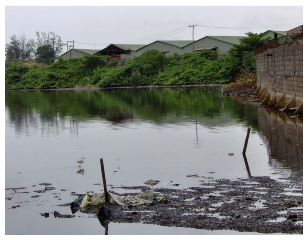
Plate 3: Industries discharging effluent into the lagoon Some of the industries using chlorine based chemicals which dump their effluent untreated directly into the lagoon behind the factories