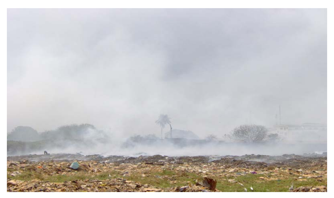
Plate 1: Open dump site at Ojota

The dumpsite undergoing burning and emission of thick fumes with likely generation of dioxins and furans