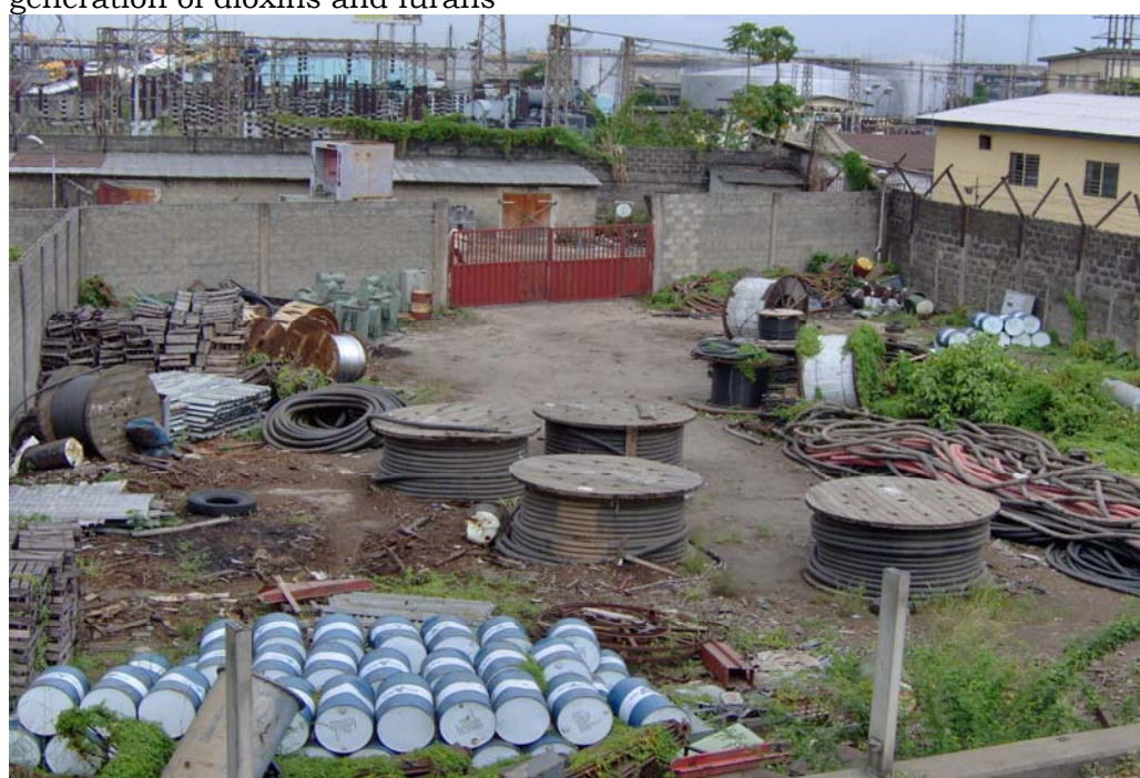
Plate 2: PHCN Workshop with obsolete transformers containing PCBs The installation at Ijora causeway with likely transformer oil leakage directly into the lagoon

The dumpsite undergoing burning and emission of thick fumes with likely generation of dioxins and furans