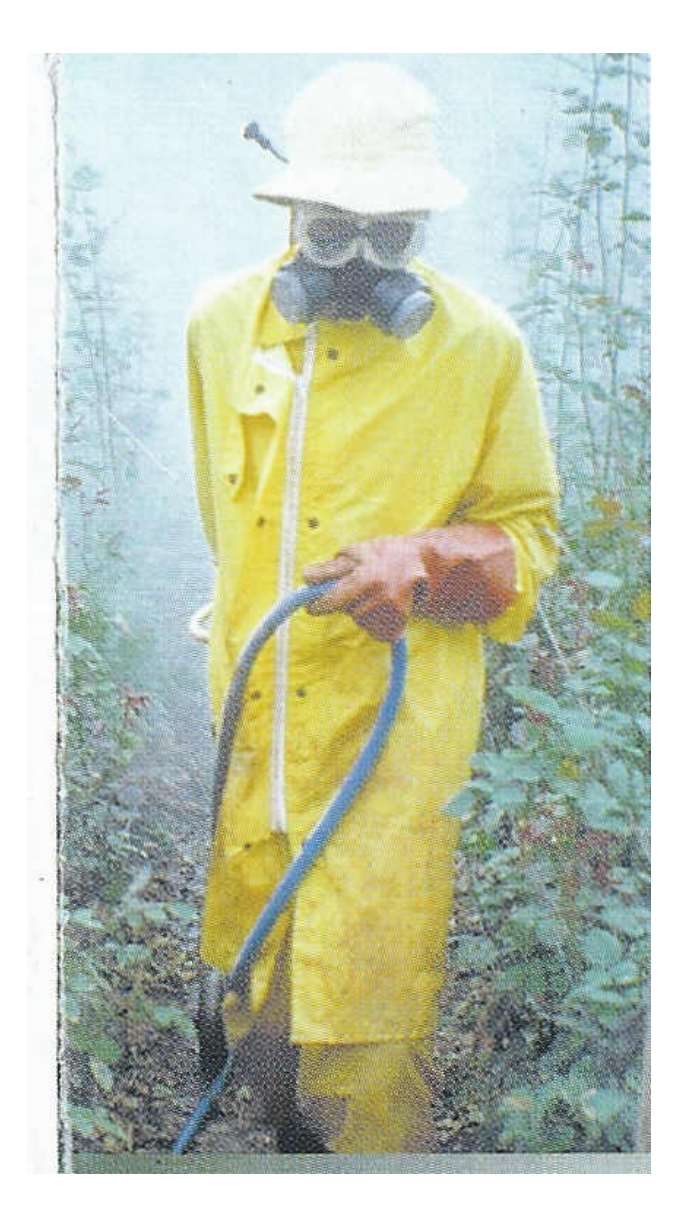
Photo 3: A worker spraying a fungicide during the monitoring exercise