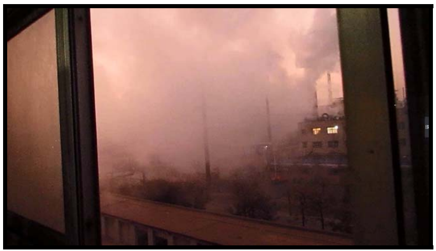
View of Lianmeng Chemical across the street from a residential apartment window

The Lianmeng facility grew to occupy over 40 hectares and produce approximately one million tonnes of urea per year among other chemicals. One problem with Lianmeng's operation was its location in the middle of residential housing on rented land. For example, Wang Chunsheng lived in Houzhang Village across the street from the facility. Wang took the pictures above and below by looking out his window.