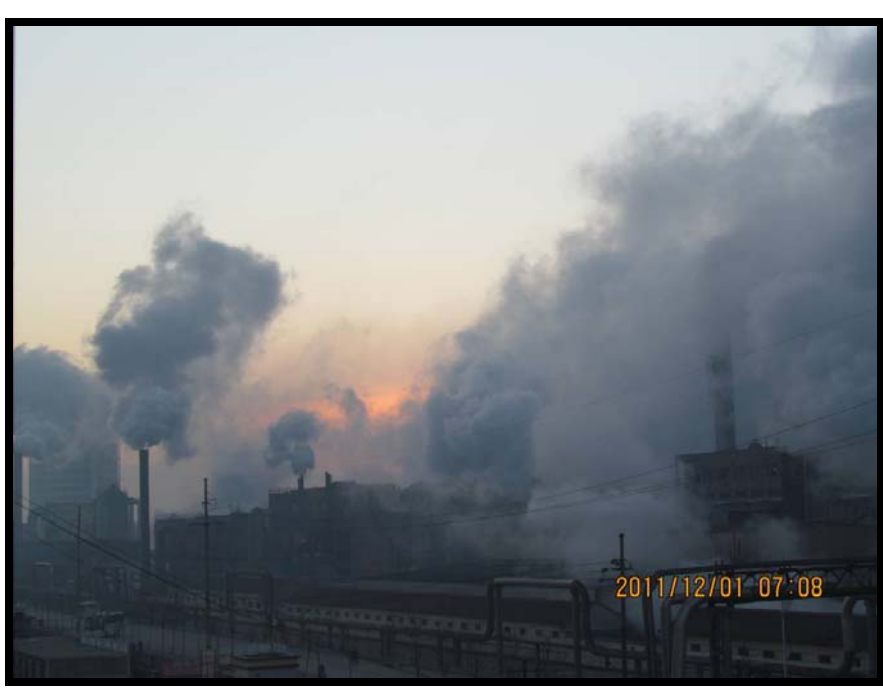
Lianmeng Chemical

Shandong Province is a key region for economic development in China. The Province is a major agricultural production base, contains the second largest oil field in China, and operates one of the top ten coal mines in the country. In addition, Shandong has been the leading province in China for the chemical industry for the past 20 years and reached 1.95 trillion yuan in sales in 2011 – 17% of China's entire chemical industry revenue. In 2013, Shandong Province contained more than 150 development zones including 137 provincial level zones along with 13 state level economic and technological development zones, and three export processing zones, among others.