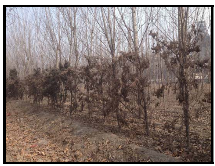
Dead trees outside the Luli Steel smelter; photo by Wang Chunsheng