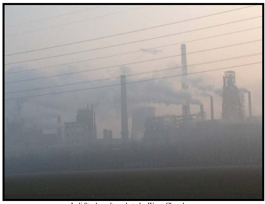
Luli Steel smelter