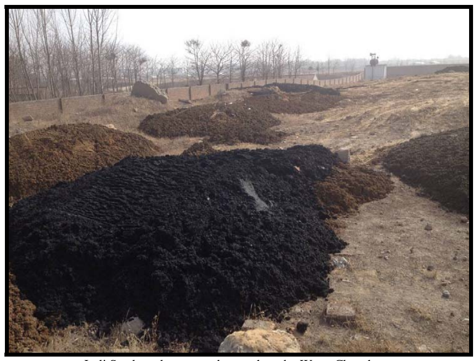
Luli Steel smelter waste dump