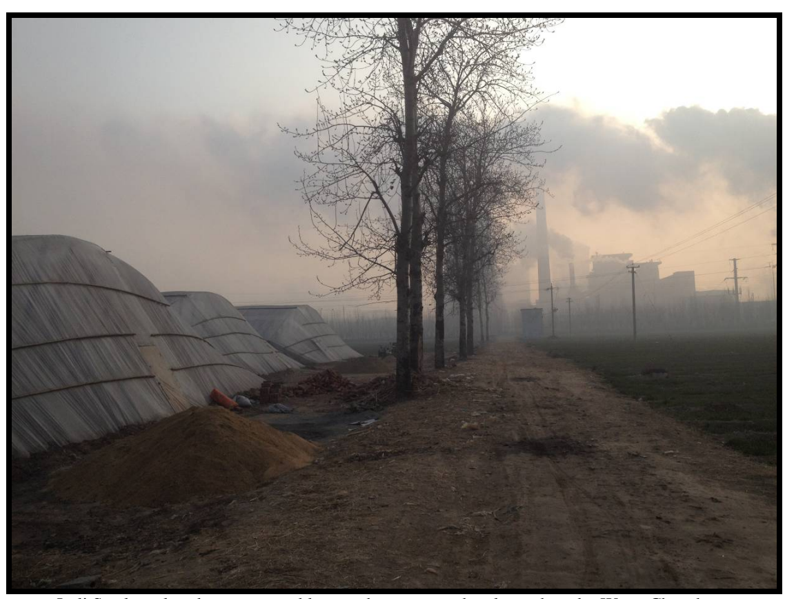
Luli Steel smelter dust on vegetable greenhouses near the plant; photo by Wang Chunsheng

There is a railway running into the industrial park and a garbage zone more than 300 meters in length on one side of this railway. On the other side is a dump of cinder allegedly from the steel mills. Filled with wastewater, Zhangseng River flows beside the industrial park. Beside this river,