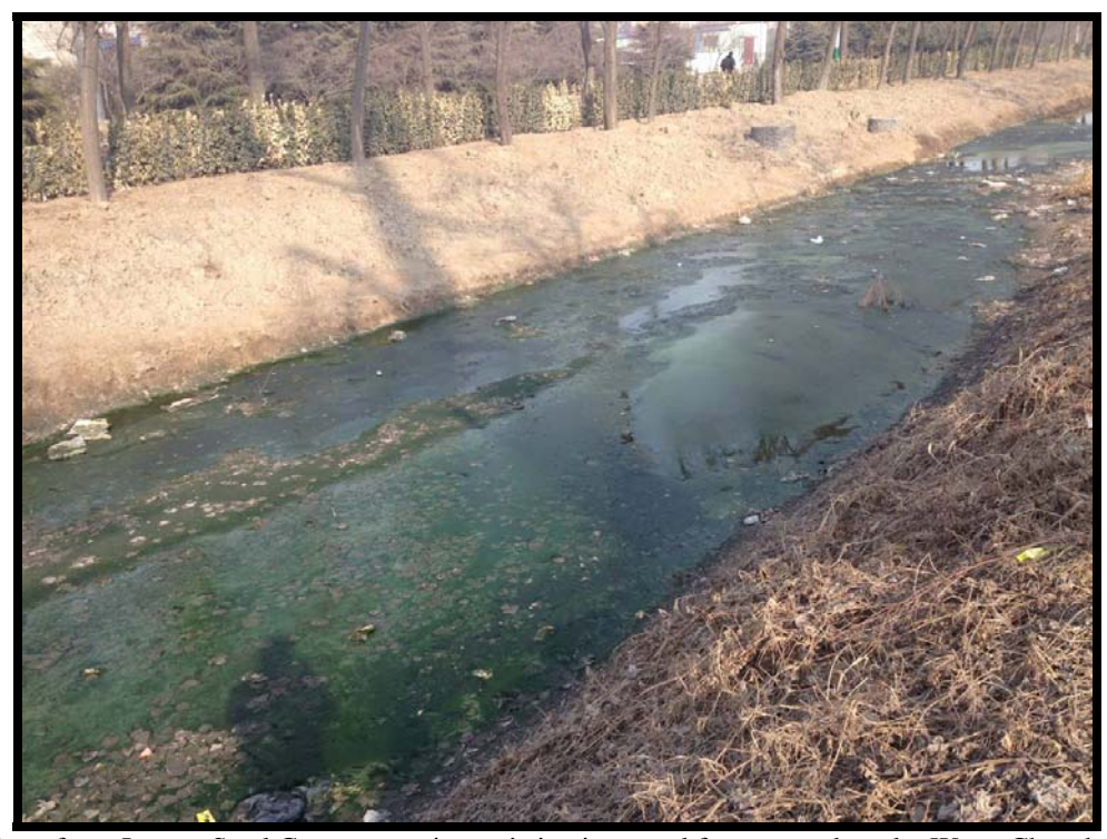
Waste from Juneng Steel Corp contaminates irrigation canal for crops