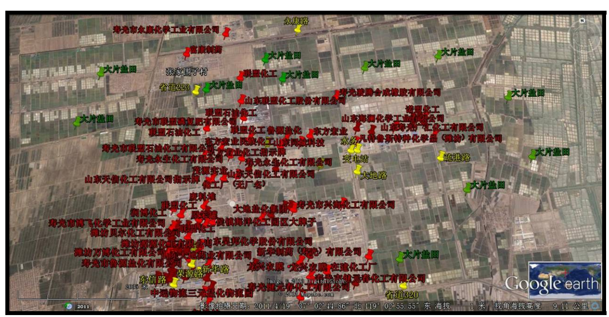
Heavy concentration of industrial parks in Chahe Town of Shouguang County; Image produced by Wang Chunsheng