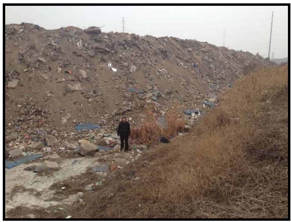
Gigantic waste pile from Juneng Steel Corp; photo by Wang Chunsheng