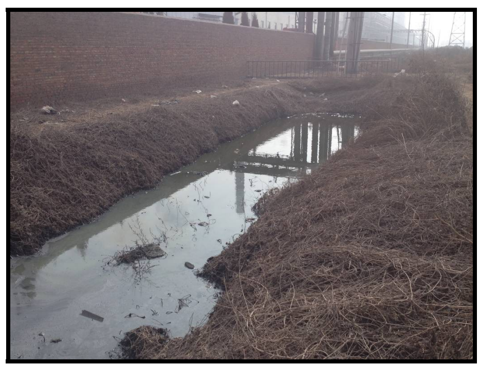
Wastewater released by Luli Steel smelter; photo by Wang Chunsheng