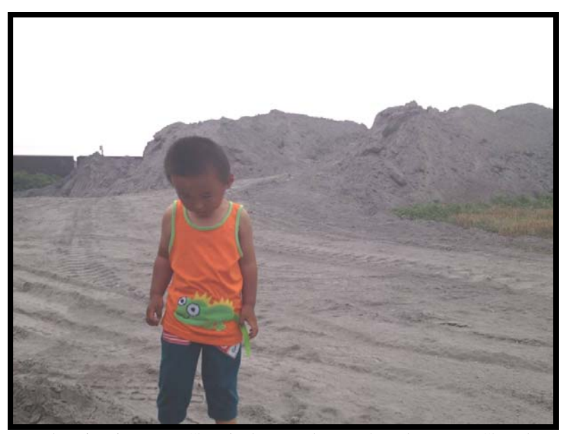
Boy plays in Lianmeng Chemical waste dump