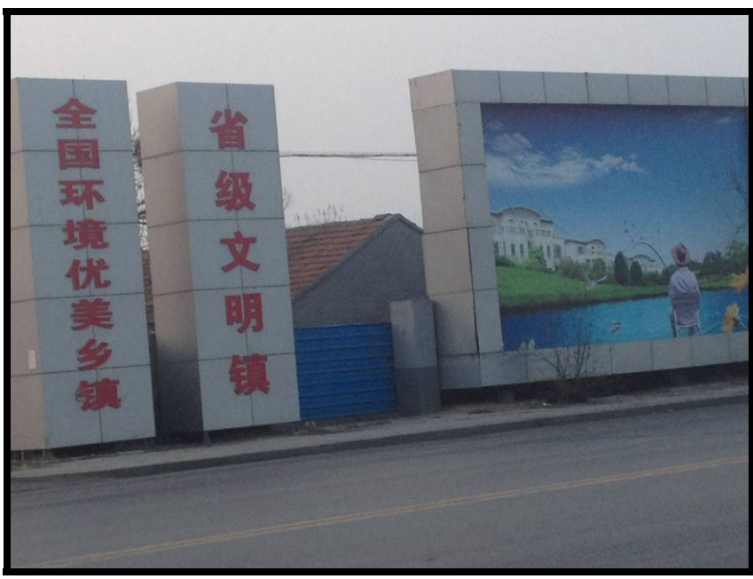
In Hou Town, Luli Steel is honored for its environmental stewardship

a buried sewage pipe runs to a sewage treatment plant in Yangkou Town. We sampled wastewater from within a sewer. It was pink. There was a sign less than three kilometers away from the industrial park, that reads, "Level 1 Protected Source of Drinking Water". But here we could still smell garbage.