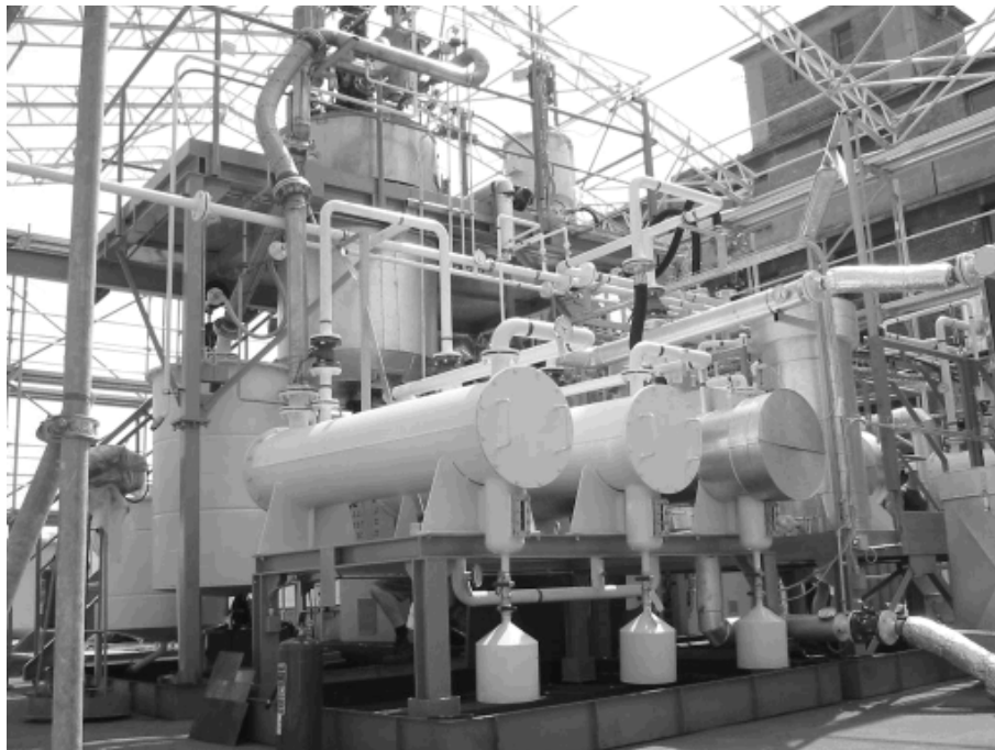
The BCD Unit at Spolana

The thermal desorption unit heats contaminated materials to 500-600 C stripping in absence of oxygen and POPs are collected in filter and condensation system. The BCD unit (see below) then treats this concentrate.