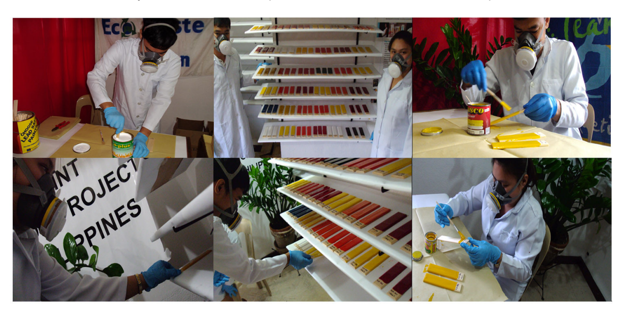
Figure 1. Preparation of Paint Samples.

Paint sampling preparation kits containing individually numbered, untreated wood pieces, single-use paint brushes and stirring utensils made from untreated wood sticks were assembled and shipped to the EcoWaste Coalition by the staff of the IPEN partner NGO, Arnika, in the Czech Republic.