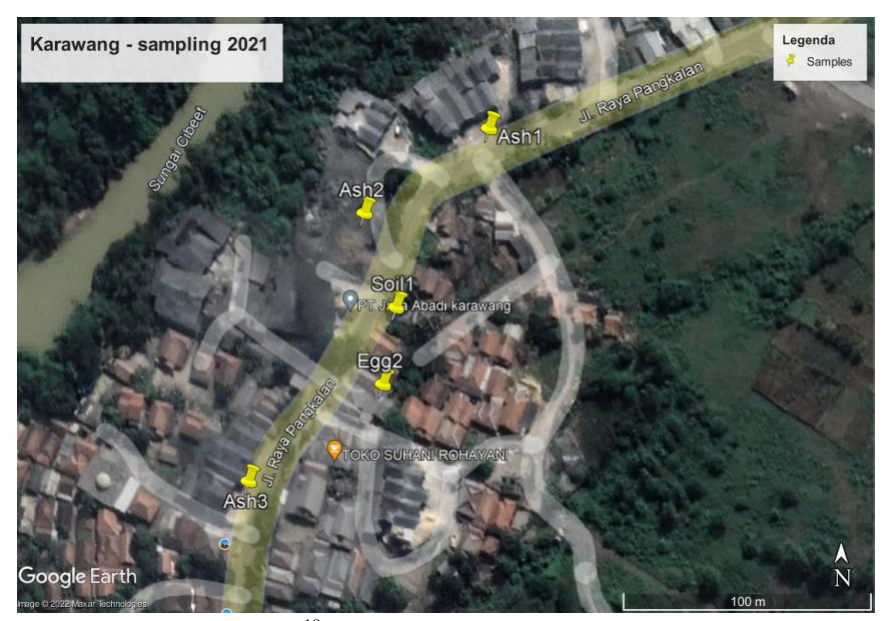
Figure 1: Map with group of samples in the middle of lime kilns concentrated around the road, locality Karawang II.

The identification and quanti-fication of PBDEs were performed using gas chromatography coupled with mass spectrometry in negative ion chemical ionisation mode (GC-MS-NICI). The identify-cation and quantification of HBCD isomers and selected PFASs were performed by liquid chromatography interfaced with tandem mass spectrometry with electrospray ionisation in nega-tive mode (UHPLC-MS/MS-ESI).