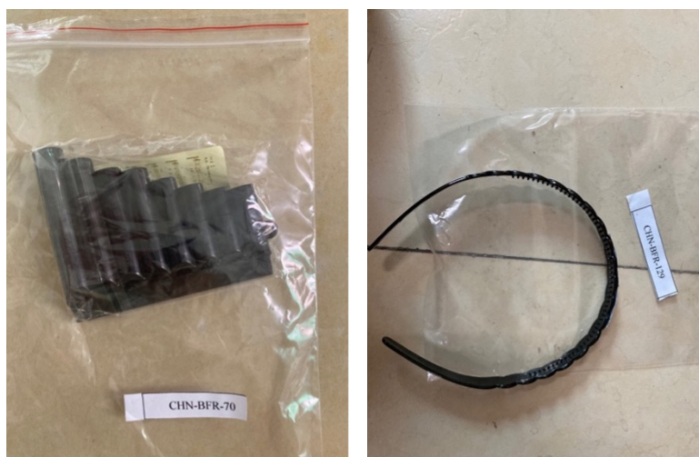
Figure 1. Examples of items in the two categories: toys and hair accessories

Samples of toys (22) and hair accessories (6) were collected by IPEN POs in Russia, Indonesia, and China (Figure 1). UV stabilizers were extracted from pellets using ultrasonic extraction with dichloromethane and subsequently determined using ultra-high performance liquid chromatography-mass spectrometry/mass spectrometry (UHPLC-MS/MS).