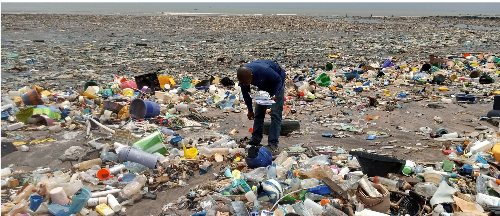
Plastic waste washed up on shore in Guinea.

Yamashita et al. analyzed 145 preen gland oil samples in 32 species of seabirds from several remote islands and locations spread across the globe (including Marion Island, St. Lawrence Island, and Kerguelen Island) and found that high concentrations of additives were found in species with high levels of plastic ingestion (Yamashita et al. , 2021). Studies on seabirds have shown that UV-328 can leach from plastic pellets upon ingestion and accumulate in the liver and adipose tissue (Tanaka, Watanuki, et al. , 2020), thus further proving the propensity for plastic particles to act as carriers for UV-328.