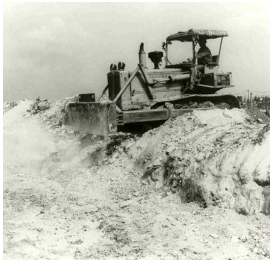
Stockpiles of toxic HCH waste isomers left over from lindane production.

dimethicone lotion, a substance with a long-chain linear silicone base that acts through physical means that will not be affected by resistance to neurotoxic insecticides. 30 Dimethicone lotion has been shown to be more effective than malathion and permethrin treatments in recent observer blinded studies. 31,32 Another article in the journal Pediatrics reported that the use of Cetaphil cleanser was 96% effective and had a 94% long-term cure rate with no toxicity. Cetaphil cleanser was found to have cure rates exceeding those of permethrin, malathion, “Bug Busting” (particular type of mechanical removal used in the UK), and dimethicone. 33