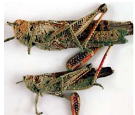
Plague locust ( Chortoicetes terminifera ) covered with Metarhizium anisoplia fungal spores.

Locusts are major economic pests that cause crop losses and damage throughout the world's dry zones. There have been serious outbreaks of this insect in recent decades. The Food and Agriculture Organization of the United Nations (FAO) has worked in collaboration with other agencies to develop alternative control methods to chemical pesticides to manage locust populations. Their research included the development of a natural and cost-effective bio-pesticide based on the acridid-specific fungal pathogen, Metarhizium anisoplia var. acridum , which presents a viable alternative to chemical pesticides to control locusts. 89 IMI 330189, the strain of Metarhizium anisoplia var. acridum most studied for its ecological risks and efficacy was developed by the international research project LUBILOS (Lutte Biologique contre les Locustes et Sauteriaux) and is currently commercially available under the trade name Green Muscle®. The CSIRO (Commonwealth Scientific and Industrial Research Organisation) developed another strain, also commercially available known as Green Guard®. 90,91,92,93