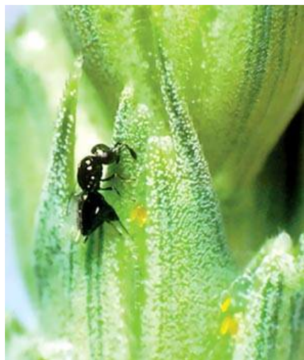
Macroglenes penetrans , egg-larval parasite of the wheat midge.

Integrative Pest Management (IPM) strategies have been incorporated in countries such as Canada and the United States to control populations of the wheat midge. Crop rotation deters the buildup of midge populations in the soil when wheat fields are replaced with crops not susceptible to midge, such as oilseeds, soybeans, flax, beans, lentils, chickpeas, and pulse crops