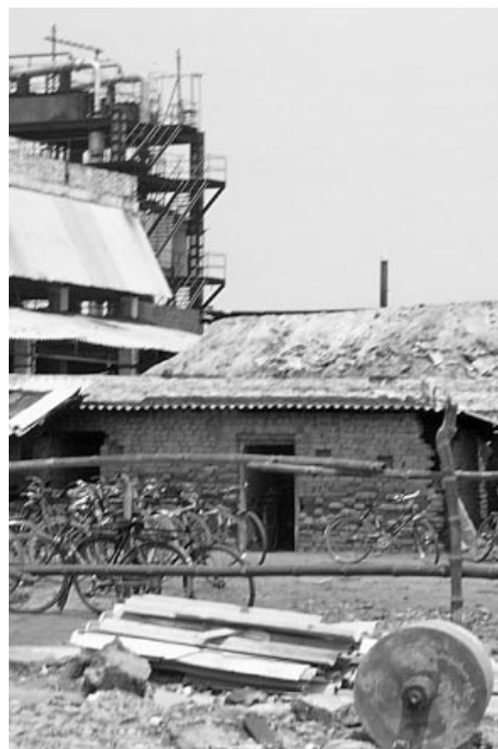
India Pesticides Limited's "Muck Yard" seen behind the plant. Worker's shed and cycle stand is located right next to the yard.

With the banning of lindane, many countries have established alternative methods to effectively prevent harm to seeds and crops in lieu of the use of lindane. The non-insecticidal strategies currently known include: crop rotation where a non-host species is planted to reduce the damage of infestation and maintain low levels of pests; site selection and monitoring to determine if a crop-damaging pest is present; fallowing the area for a few years before planting to starve the pests; careful seed selection and re-seeding with resistant crops; timing of seeding and planting; zero or reduced tillage regimes; increasing seeding rates; shallow seeding; good seed to soil contact; balanced fertility levels to ensure that plants are not predisposed to disease; avoidance of excessively wet seed beds; and use of more competitive crop varieties to limit losses from these pests. 56,57 Other non-chemical alternatives to lindane include biological control methods that utilize predators of the