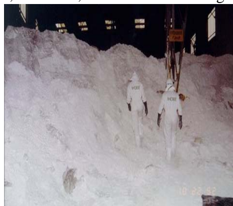
Workers in a lindane factory. For every ton of lindane that is produced, nine tons of toxic waste is discarded. 43 (John Vijgen, International HCH and Pesticides Association)

According to the U.S. Agency for Toxic Substances and Diseases Registry (ATSDR), inhalation of alpha, beta and gamma HCH can result in blood disorders, dizziness, headaches and changes in sex hormone levels in the blood. 4 The estrogenic effects of HCHs, including lindane, have been found in both animals and humans. In a nested case-control study conducted in Spain, maternal exposure to organochlorine pesticides including lindane is associated with cryptorchidism and hypospadias in their sons. 5 In women, HCH exposure has been linked to breast cancer and cancers of the reproductive tract. Beta-HCH accelerates the appearance and incidence of malignant breast tumors in mice. 6 It has also been shown to act as a breast cancer promoter in human breast cells. 7 A recent study in Jaipur, India found that blood lindane and organochlorine pesticide levels were significantly higher in women with cancers of the reproductive tract than in the control group. 8 The International Agency for Research in Cancer (IARC)