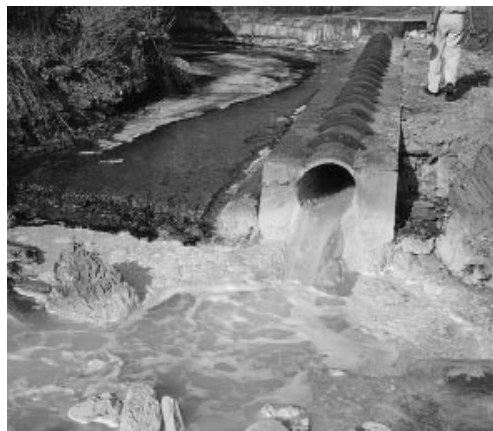
Kanoria Chemicals and Industries Ltd's effluent discharge pipeline into Donki Nala River in India.

Our findings demonstrate that one 30-minute application of hot air has the potential to eradicate head lice infestations. In summary, hot air is an effective, safe treatment and one to which lice are unlikely to evolve resistance. There were no adverse effects of treatment. 24