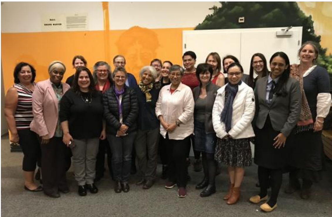
Women's Caucus meeting participants in Geneva

The multi-lingual group of women talked about experiences at international and regional policy meetings, overcoming challenges, and how best to support one another. Plans are currently being made for follow-up meetings and exchanges.