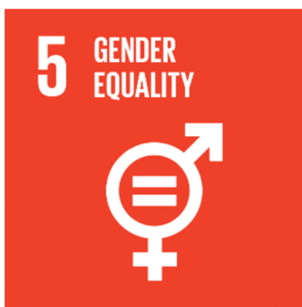
SDG 5: Gender Equality