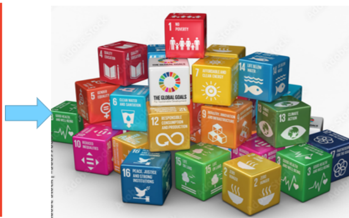
Sustainable Development Goals (SDGs)

IPEN's Gender Initiative was born in 2016.