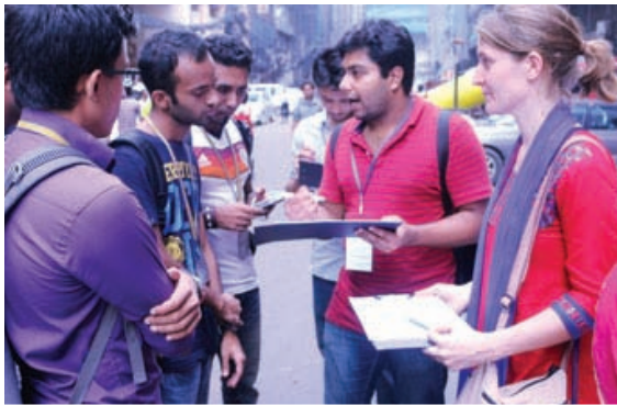
Figure-5 Photos of Signature campaign and public awareness on lead paint