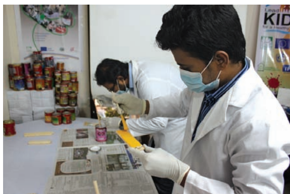
Staffs used a new paint brush and avoided cross contamination of the samples during the sample slide preparation