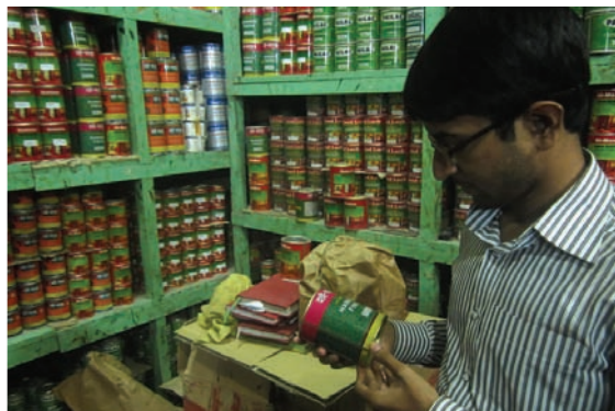
Selection of the paint samples