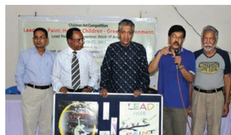
Global Alliance to Eliminate Lead in Paint- GAELP Week Celebration 2014 (Human Chain, rally, art competition and launching of new IEC materials)