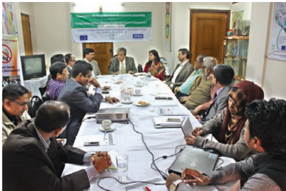
Consultation with Certification & Eco-Labeling of Lead Free Paints