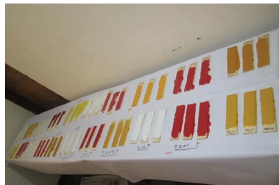
Application of the paints to wood pieces and drying of the painted woods