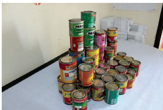
Paint samples for the experiment