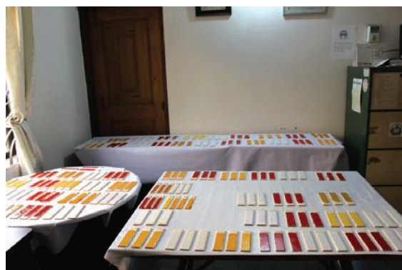
Samples were left to dry before being sent to lab for testing