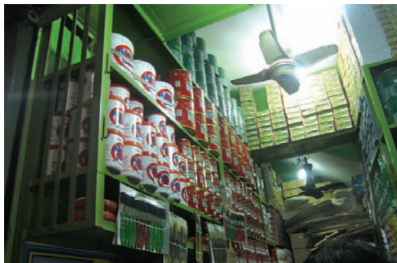
Paint cans display at the shop