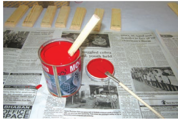
Wood pieces and brushes for sampling