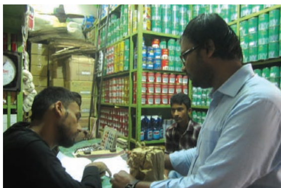
Purchasing of paint samples