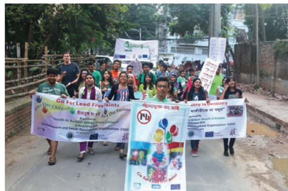
Media Campaign for lead free paint