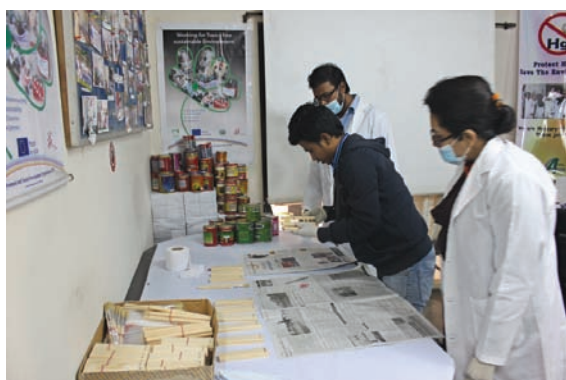
Materials for paint sampling