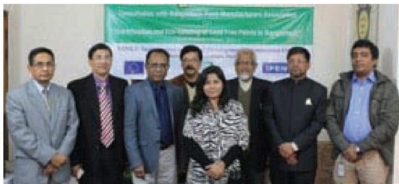
With Bangladesh Paints Manufacturers Association- (BPMA)