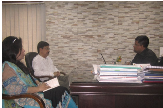
Meeting with General Secretary, BPMA