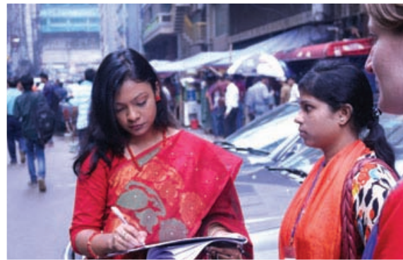
Mobile Awareness and Signature Campaign