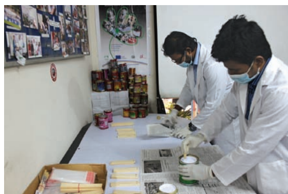
Each sample was stirred before sampling